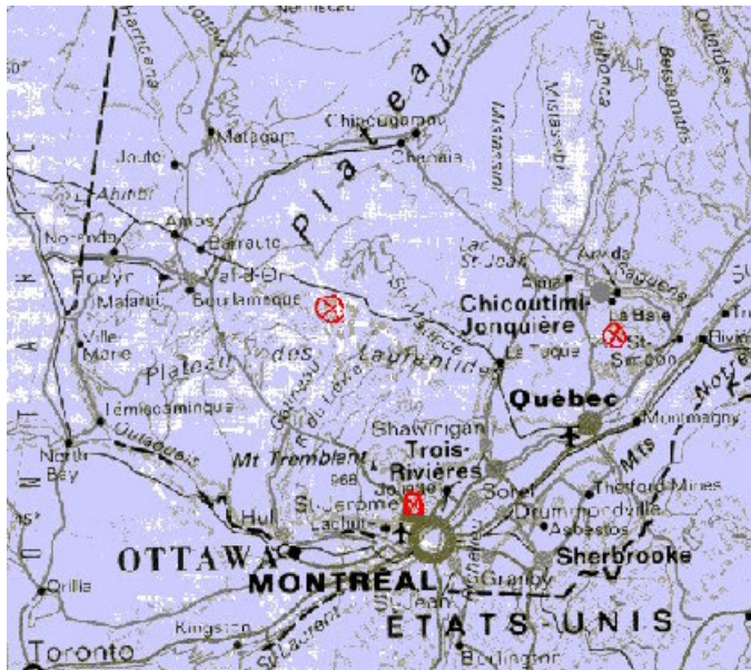
Quebec Map: Map of the province of Quebec